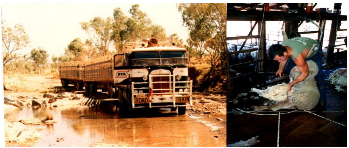
Driving one day, shearing the next

It was a rough and ready life and you had to be a jack of all trades. Pushing cattle on and off trailers, changing flat tyres and repairing them on the side of the road in all types of weather, and doing makeshift repairs on the truck or trailers.