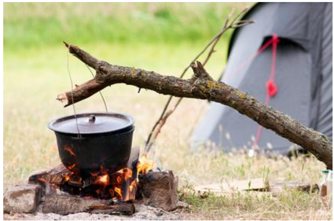
Aussie inventiveness - the correct way to cook baked beans

On the road you learn to work with what you've got, which leads to many new inventions. I designed and made a 4-way tyre inflator complete with four taps and a built-in pressure gauge. I used this in the desert to reduce the pressure in the drive tyres so I could get over the soft sand. It was particularly useful when I came to re-inflate the tyres as I could pump all four at once. When I carted cattle out of the desert I needed to load up at first light and get going while the sand was still cool from the night air. It was more compact then, becoming looser and harder to drive on as the day warmed up.