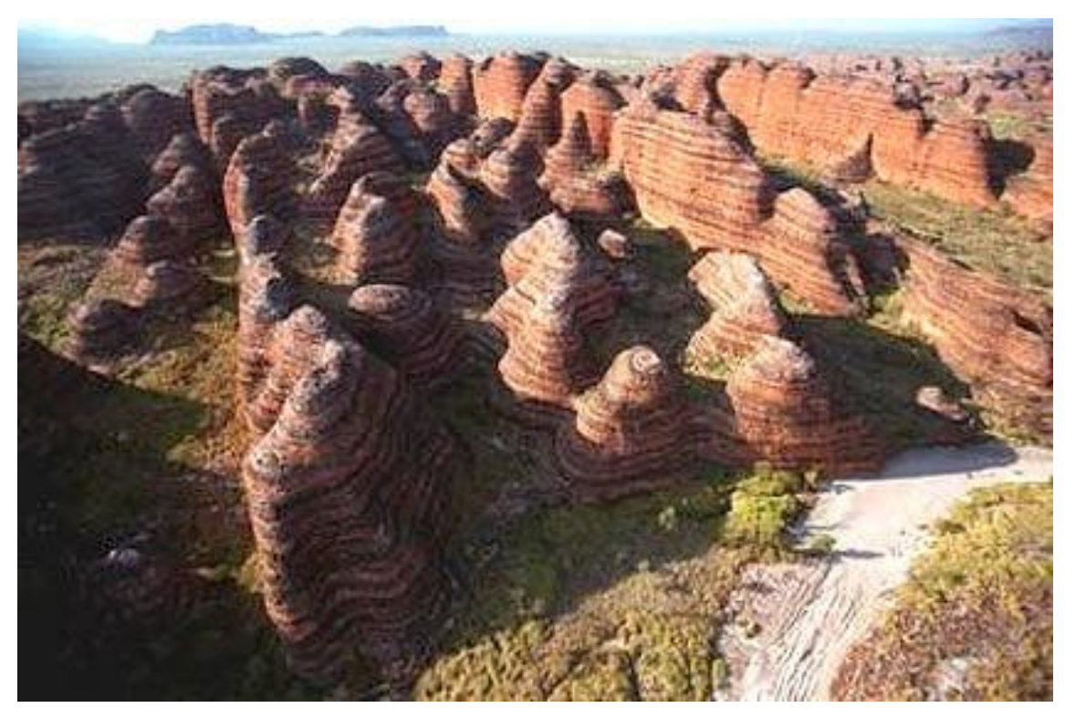
Bungle Bungles - Kimberleys

When travellers on our Air Safari catch their first glimpse of the Kimberleys, their reactions range from silent awe to loud amazement. I've flown over them at least six times, but each time I see them I'm lost for words – and as those who know me will agree, that doesn't happen often.