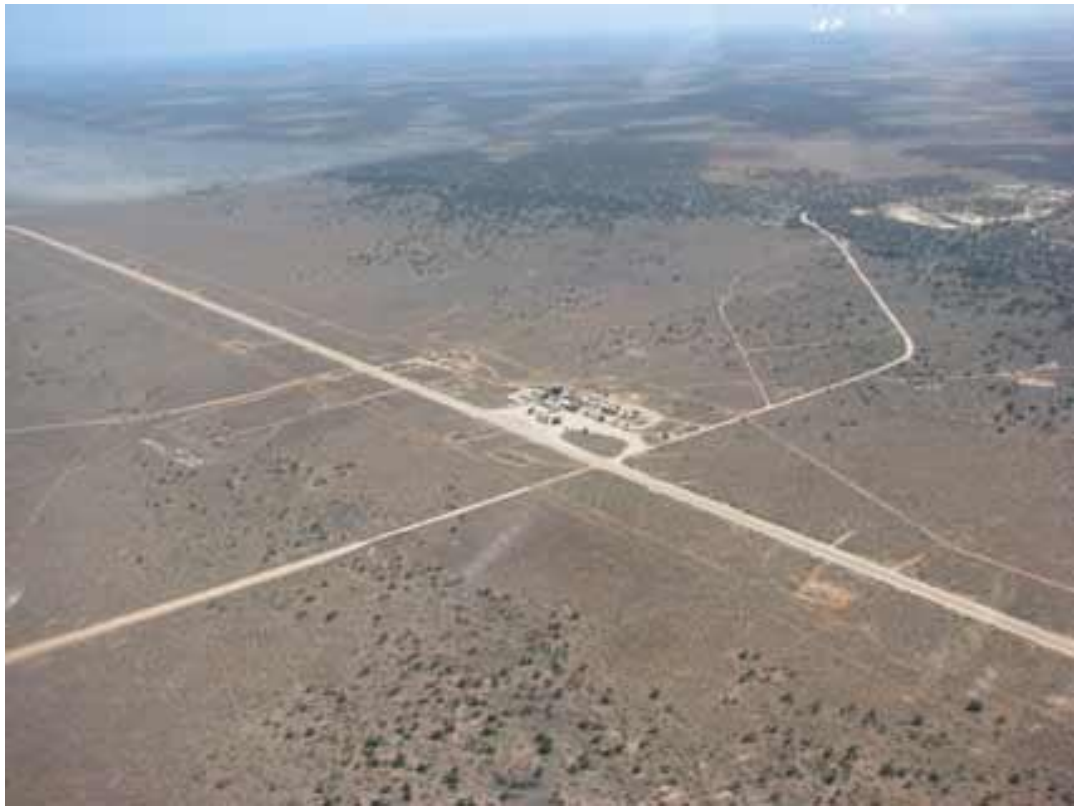
The road across the Nullarbor

In my three years of driving road trains I was very lucky as far as accidents go. I witnessed a few close calls and had a couple myself, but no serious injuries.